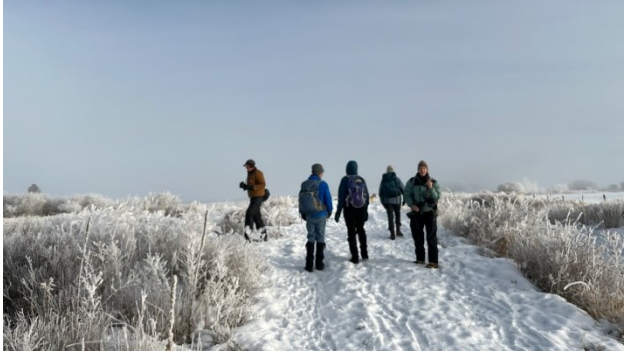
A foggy, frosty start to the Hamilton CBC on the Maki Ranch. The group searches for American Tree and Song Sparrows along Willow Creek.