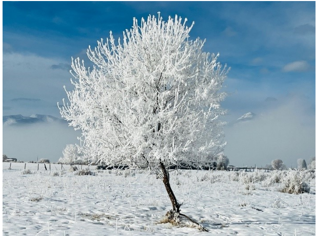
Frosted beauty on the Hamilton CBC.