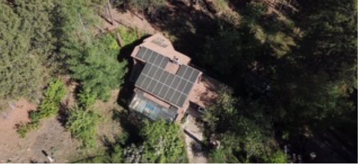
Local Solar Project Designed & Installed by SBS Solar"