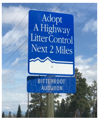
Join the few, the brave, the beautiful for our next Highway Cleanup!