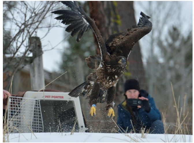
Golden Eagle release.

Few people have the dedication it takes to commit their lives to wildlife rehabilitation. These are the people who provide rescue, veterinary care and rehabilitation, or humane death when wildlife are injured, often by the actions of people. Most of the reported injured raptors in the Bitterroot make their way to Wild Skies Raptor Center. Just in the past couple of years, Wild Skies has admitted over 60 injured raptors from the Bitterroot Valley, including the famous Great Gray Owl "Gracie". Many of the birds they rehabilitate have suffered from vehicle, fence, or window collision, entanglement in fishing line, lead poisoning from ammunition fragments, injury from domestic cats or intentional shootings. Many of these injuries are preventable, so part of the Wild Skies mission is to educate the public about ways they can reduce or eliminate wildlife injury.