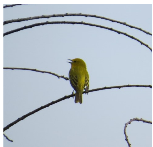
Yellow warblers are one of many bird species relying on riparian habitat.

Bitter Root Land Trust and Bitterroot Audubon welcome you to explore the winged creatures making their home in the *future* Skalkaho Bend Park.