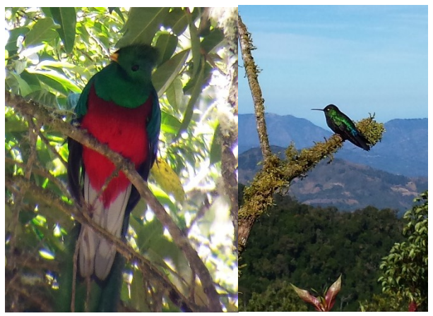
Resplendent Quetzal and Green Violet-ear Hummingbird

Though relatively small in size, Costa Rica is home to one of the highest levels of bio-diversity in the world. The country's cloud forests, humid lowlands, dry forests and mangrove swamps are some of the 6 ecological zones and more than 12 ecosystems that are home to more than 900 species of birds. That is more than the United States and Canada combined!